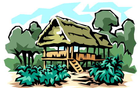
Maintaining a "base camp".

You will learn ways to leverage good ideas and personal influence.